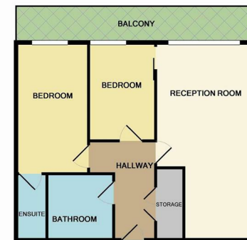
Measurements are approximate. Not to scale. Illustrative purposes only. Made with Metropix ©2014

These particulars are believed to be accurate but they are not guaranteed and do not form a contract. Neither Jordan Fishwick nor the vendor or lessor accept any responsibility in respect of these particulars, which are not intended to be statements or representations of fact and any intending purchaser or lessee must satisfy himself by inspection or otherwise as to the correctness of each of the statements contained in these particulars. Any floorplans on this brochure are for illustrative purposes only and are not necessarily to scale